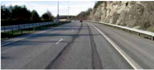
Fig. 2. Studded tire wear in Norway (Haugødegård 2008)

Norwegian Public Roads Administration to better utilize their PMS system. As seen in Fig. 1, ViaPPS is a vehicle mounted road scanner with the ability to map road condition and quality. The equipment is capable of recording 140 readings per second over the whole lane width. During operation it collects: rutting information (depth, area, and width), cross fall, marking quality, some cracking information, height of the road shoulder, measurement speed, reference position, transverse profile, international roughness index (IRI), mean profile depth, GPS coordinates, curve radius, and longitudinal profile. Approx 54 000 km