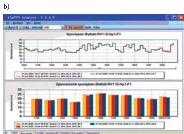
Fig. 3. ViaTech ViaPPS Analysis Screen shots illustrating: a – road profile, b – rut depth

(59%) of Norway’s road network is evaluated using this method (Haugødegård 2008).