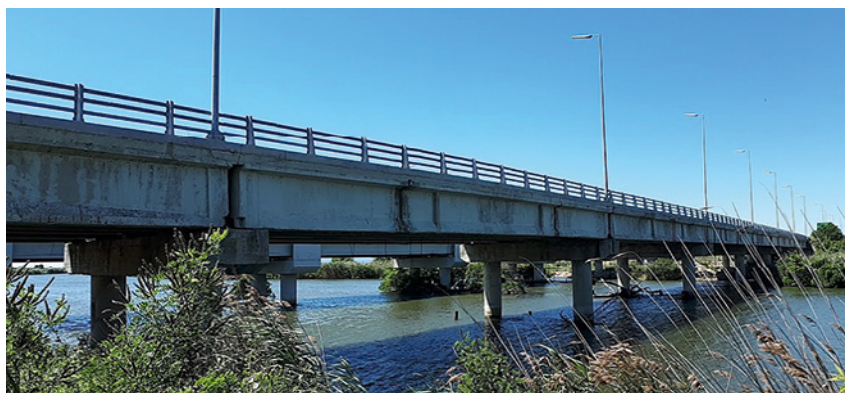
Figure 1. The Strimonas Bridge (Panetsos, 2017)

upon the piers, the deck of the bridge is simply supported through NB1 elastomeric bearings. Its expansion joints are elastomeric and of the T50 type. Finally, its identified components are the following: abutments, piers, superstructure, safety railings, sidewalks, pavement, and drainage system (Panetsos, 2017).