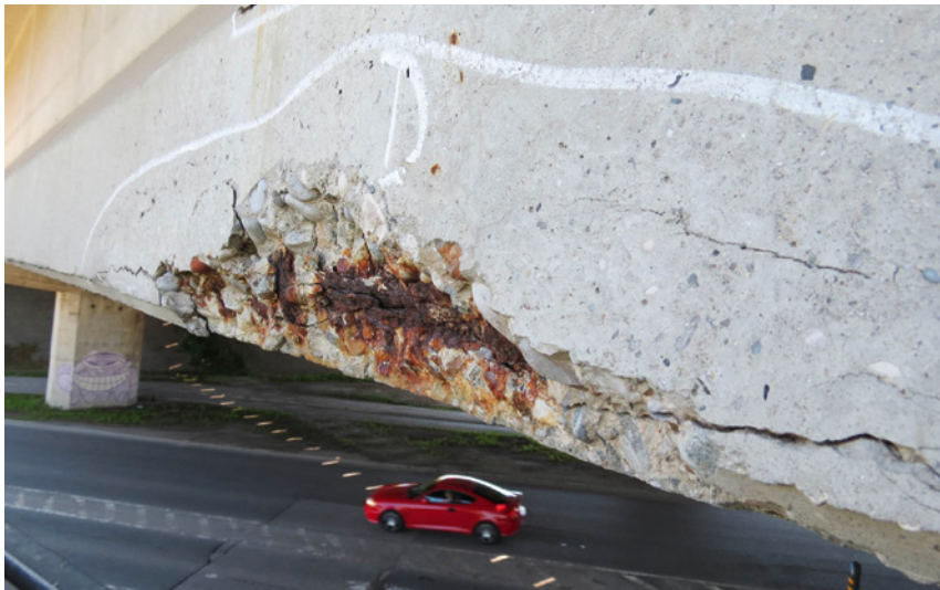
Figure 1. Delaminated concrete cover due to the corrosion of the reinforcement on a roadway bridge

Most of the roadway bridges, built before the adoption of modern principles of sustainable planning and seismic design, are approaching their design lifetime. The volume and loading of the heavy freight vehicles, which they are carrying, are considerably larger than anticipated at the time of their construction. In most cases, these bridges are structurally deficient and degraded due to the ageing effects and inadequately maintained (Figure 1). Reliable assessment of their safety to seismic and increased operational loads is therefore required before deciding on their optimal management.